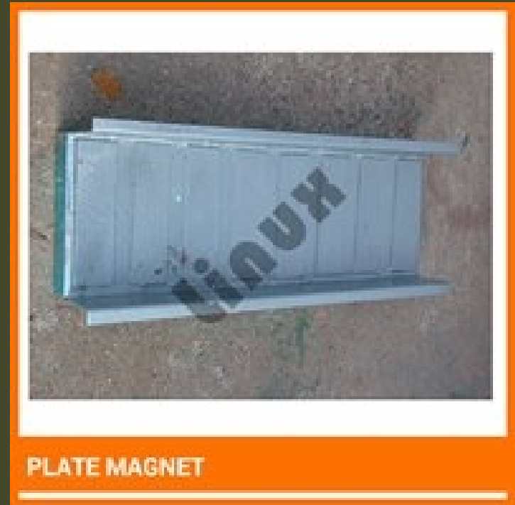
Plate magnet is a flat magnet that is used over the product to remove the ironic substance. They are designed for use in various chutes and suspension over the product. We supply and export a wide assortment of plate magnets fabricated according to the need of the client.